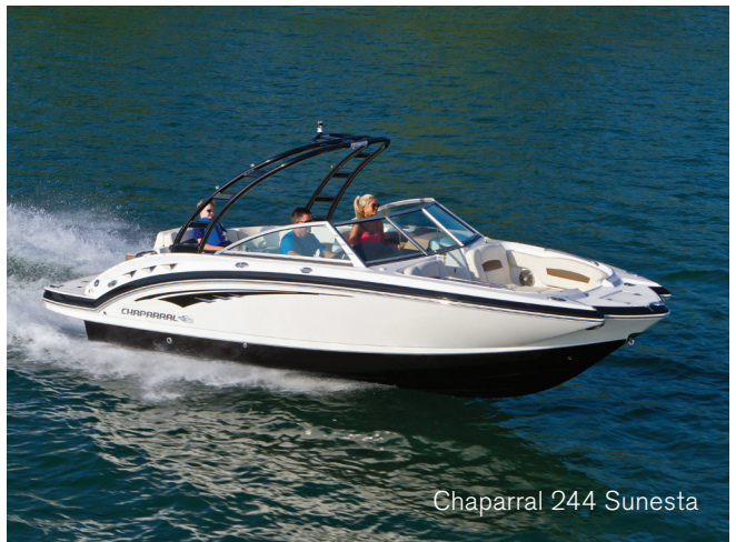
Chaparral 244 Sunesta