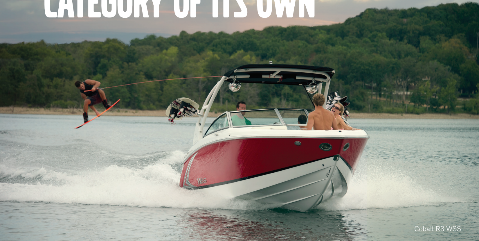
Cobalt R3 WSS

Volvo Penta has always put performance front and center. Now, we've done it literally.