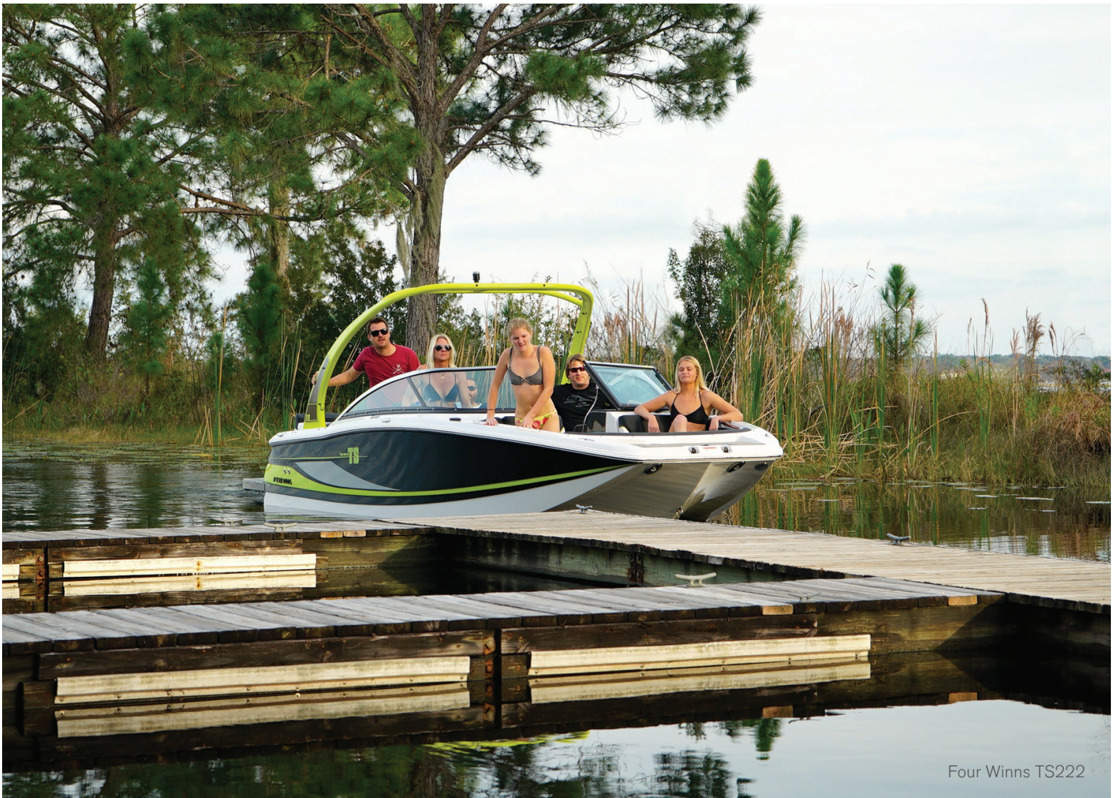
Four Winns TS222